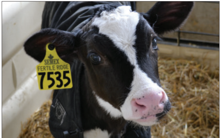
Three top Wisconsin calf raisers share their best calf management tips including "starting at the beginning," working with your farm consultants and taking top-notch care of newborns.

The ranch feeds pasteurized whole milk and uses milk replacer when whole milk quantities